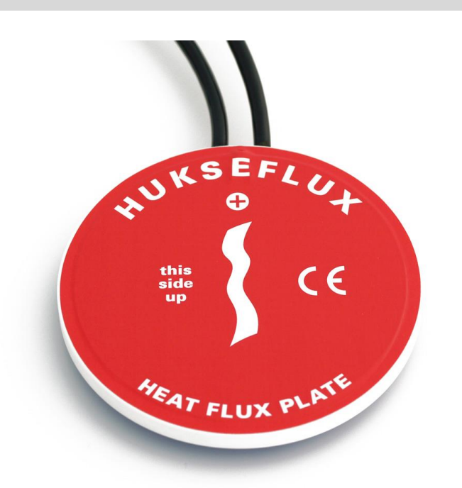
Figure 1 HFP01SC self-calibrating heat flux sensor. The opposite side has a blue coloured cover.

HFP01SC self-calibrating heat flux sensor<sup>TM</sup> is a heat flux sensor for use in the soil. It offers the best available accuracy and quality assurance of the measurement. The on-line self-test verifies the stable performance and good thermal contact of sensors that are buried and cannot be visually inspected and taken to the laboratory for recalibration. The self-test also includes self-calibration which compensates for measurement errors caused by the thermal conductivity of the surrounding soil (which varies with soil moisture content), for sensor non-stability and for temperature dependence.