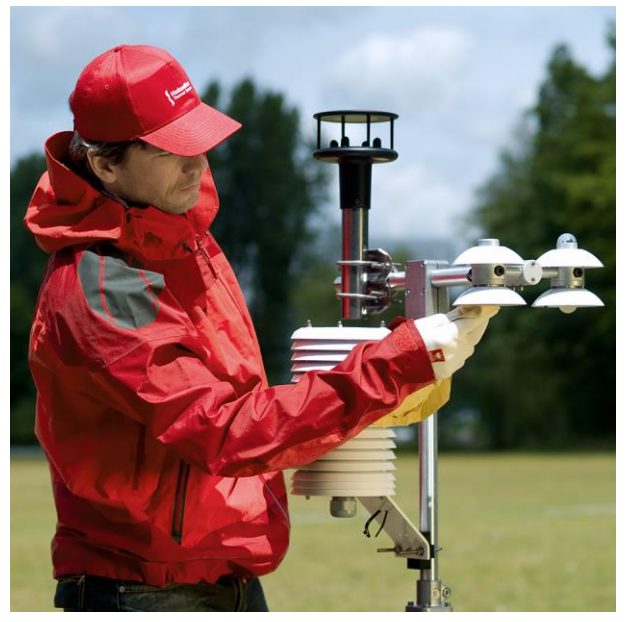
Figure 2 HFP01SC is used in soil heat flux measurements in high-accuracy surface energy flux experiments